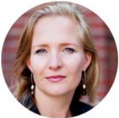
Marietje Schaake MEP, ALDE-Group